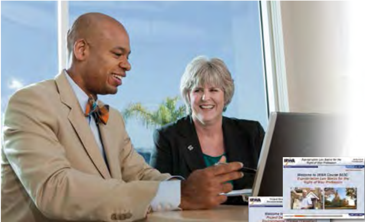
Actual IRWA members