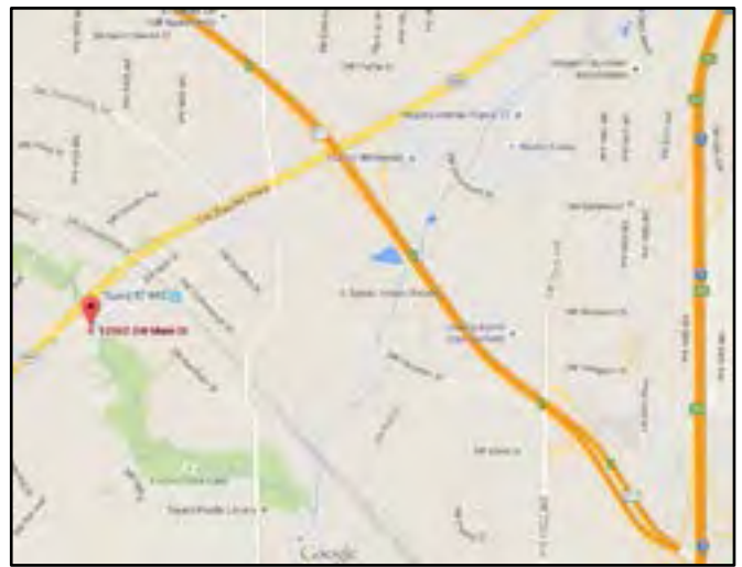
Click Map above for directions