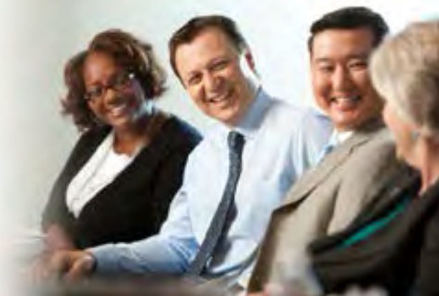
Actual IRWA members